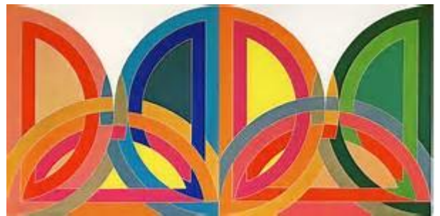
"Madinat as-Salam I" (1970)