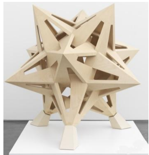
"Flat Pack Star" (2016)